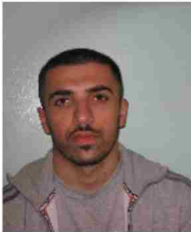
MPS custody photo 2009